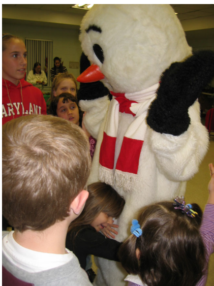
Frosty surrounded by his fans!

The 2005 West Laurel Annual Holiday Celebration was, as always, great fun for the whole family. Young and old alike enjoyed holiday crafts, light